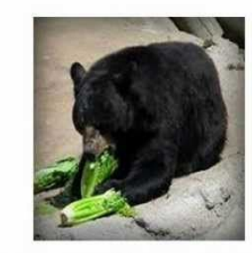
Bear eating plants