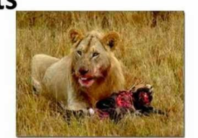
Lion eating meat