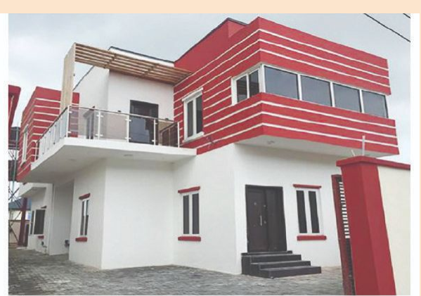
Property built on solid ground