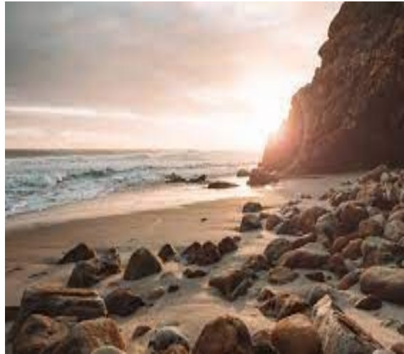
Rocks in beaches