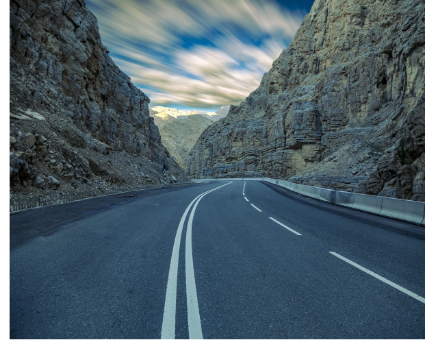
Rocks along the roadside

Rocks are found everywhere around the world.