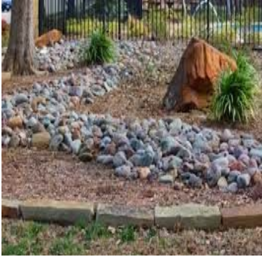
Rocks in your yards