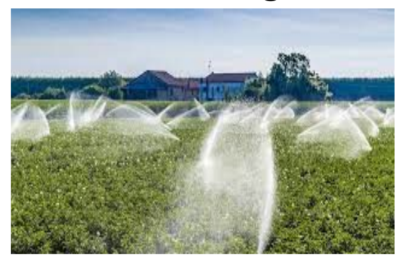
Irrigate the soil.