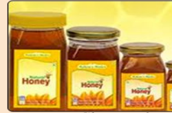
Honey Glass Bottles