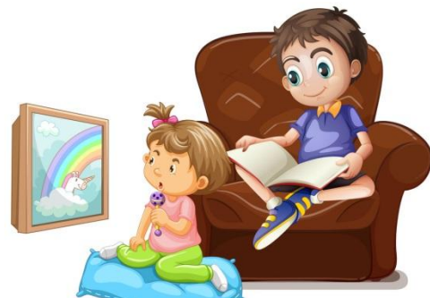
John was reading a book while Mary was watching television.