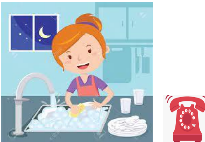
Rina was washing the dishes when the phone rang.