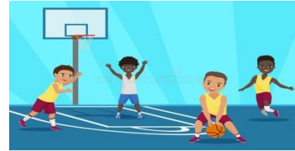
We were playing basketball after school.