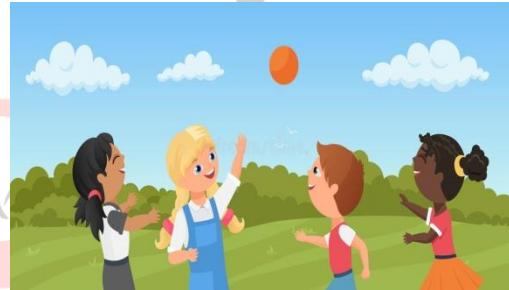
The children were playing in the park with the ball.