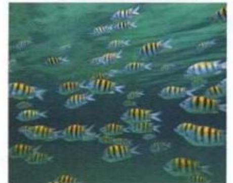
A school of fish