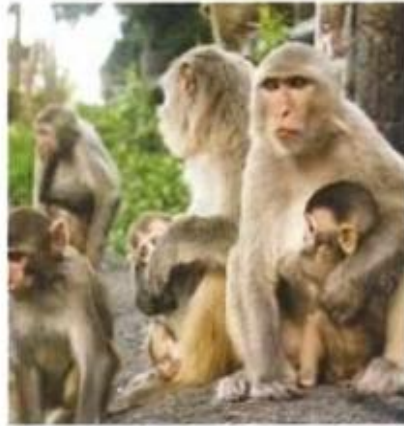
A troop of monkeys