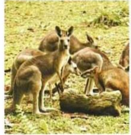
A mob of kangaroos