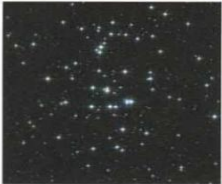
A galaxy of stars