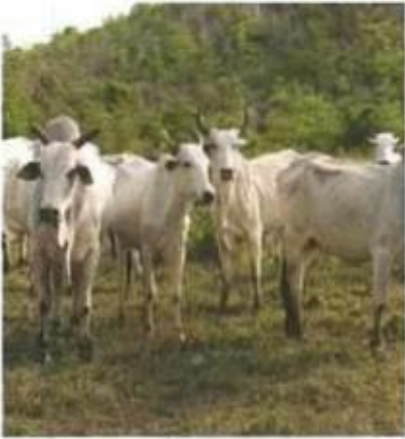
A herd of cattle