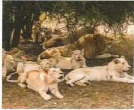
A pride of lions