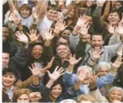
A crowd of people