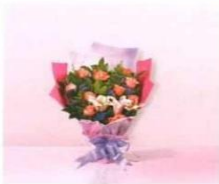
A bouquet of flowers