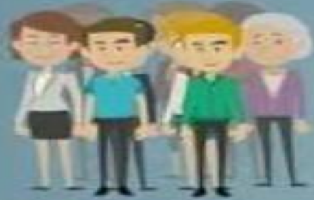
Religious Group A