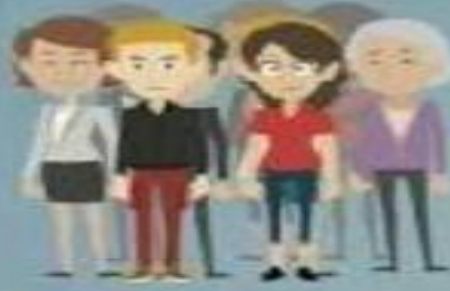
Religious Group B