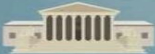
Government and Administration