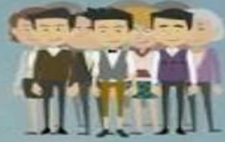
Religious Group C