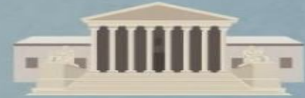
Judiciary (court system)