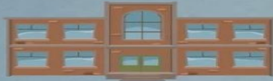
Executives (decision makers)