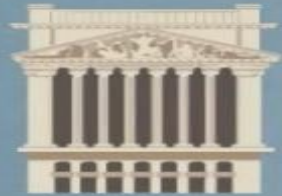
Legislature (law makers)