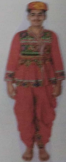
Gujarati Chemo & Kediyu