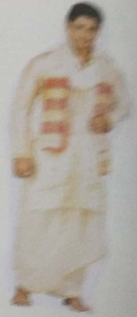
Assam- Dhoti & Gamosa