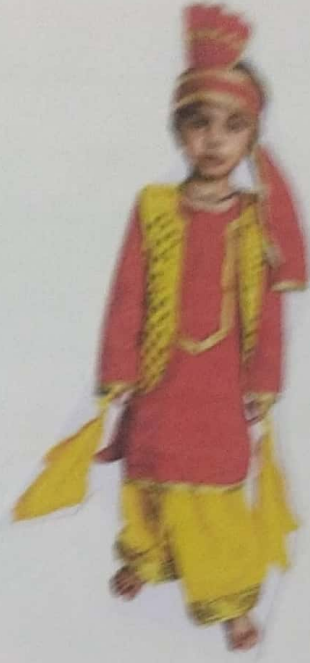
Punjab-Kurta & pajama