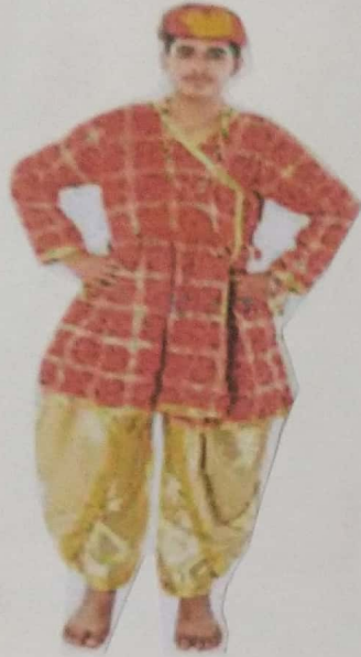
Rajasthan- Dhoti & Angarkha