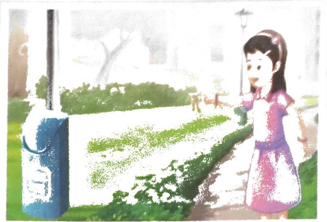
(b) That is dustbin