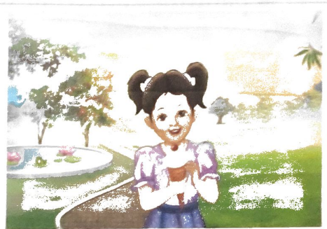
(d) This is nice cream