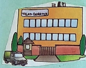
⇒ POLICE STATION