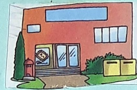
⇒ POST OFFICE