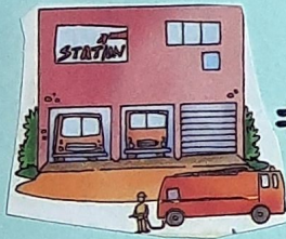
⇒ FIRE STATION