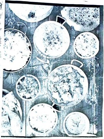
This is the thali diet of South India. They eat rice, lentils, fruits, and sweets.