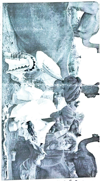
This is the traditional PASTORALISM IN INDIA. They are raising camels and sheep.