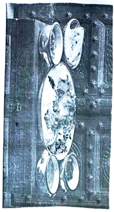
This is the diet of the Indian people. They eat rice, lentils, fruits, and sweets.