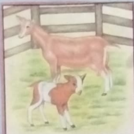
GOAT & KID