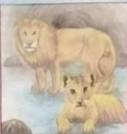
LION & LION CUB