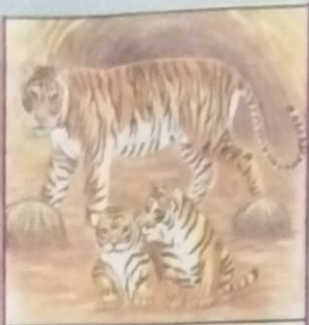
TIGER & TIGER CUB