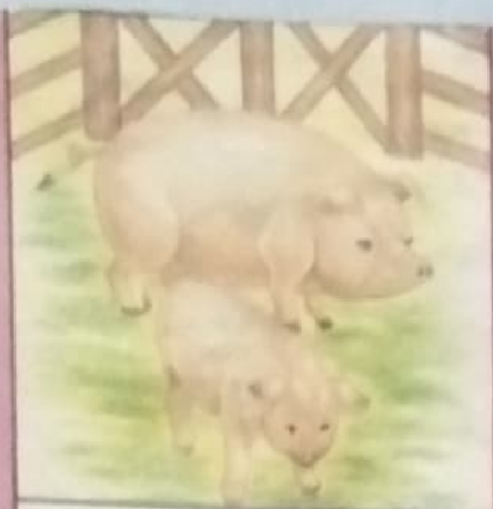
PIG & PIGLET