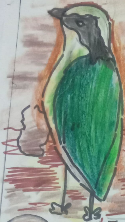
Indian Pitta ♡