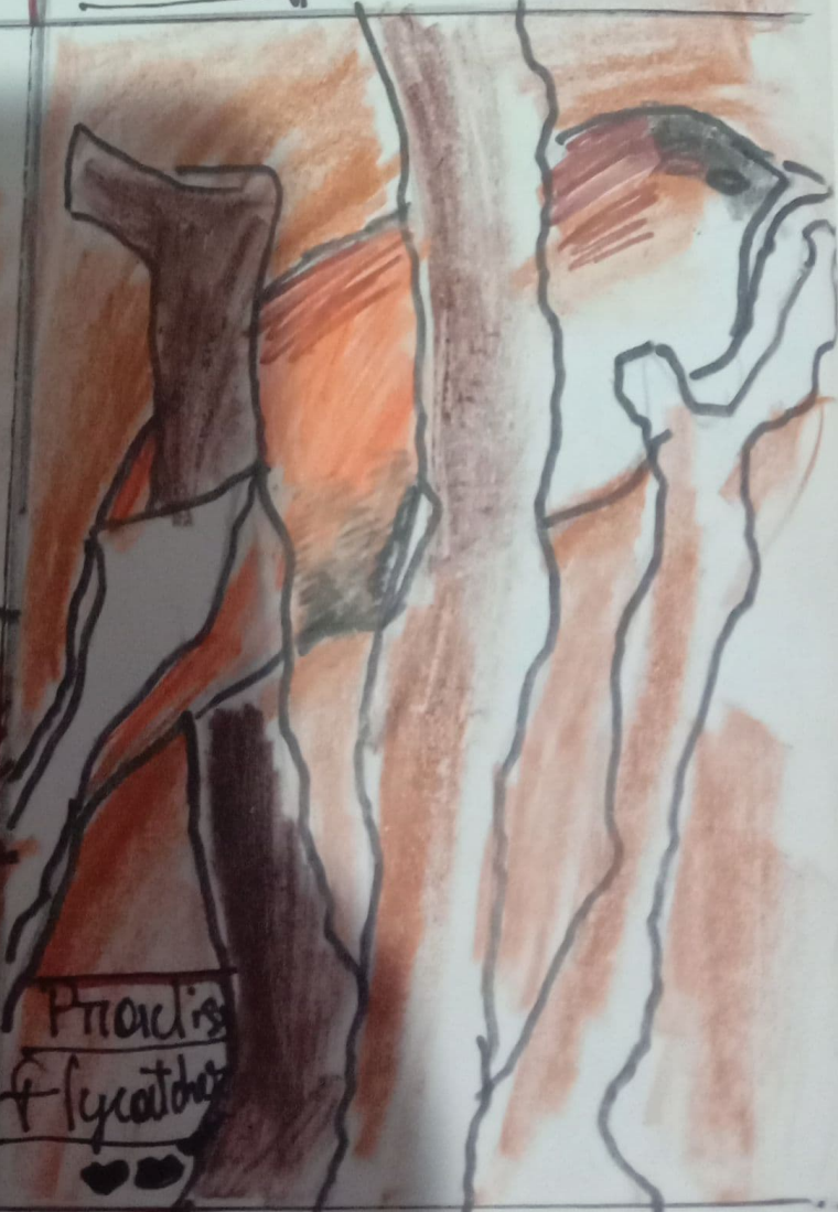
Prachin Flycatcher ♡ ♡