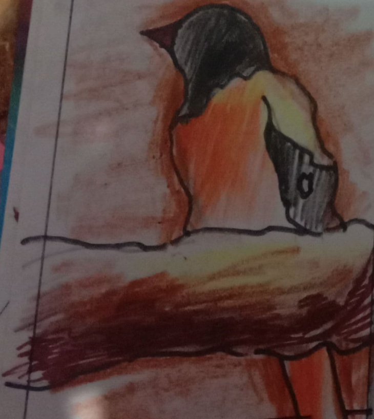
Black headed Oriole