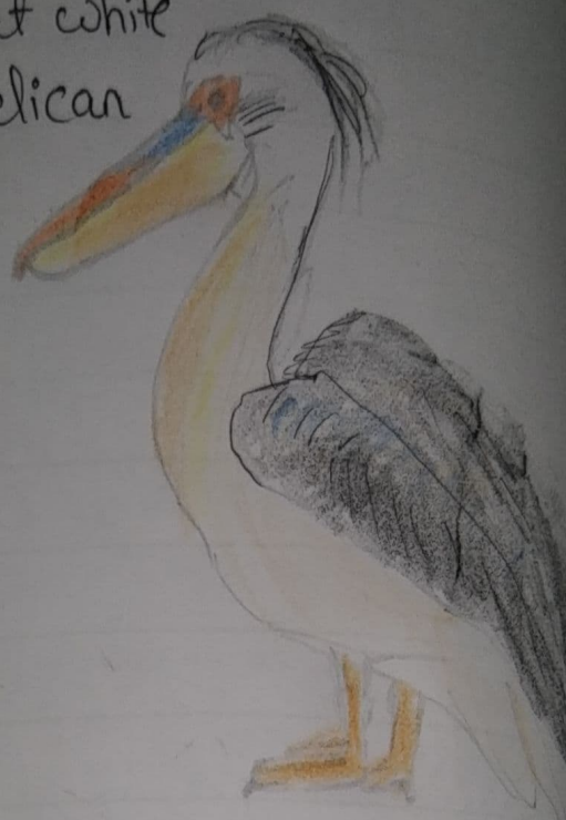
Great white Pelican