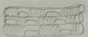
striated muscle cells