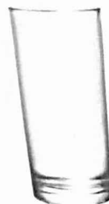
(f) empty glass