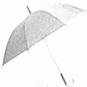
(e) blue umbrella