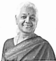
(a) old woman