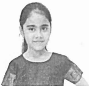
(c) little girl